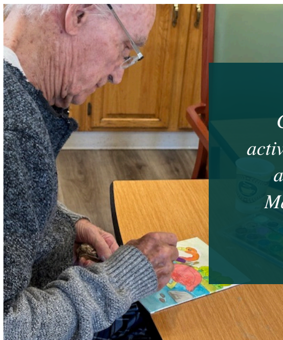
Craft activities at the Manor

If you are currently experiencing symptoms of illness, please do not visit our facility. Additionally, if a close family member is also experiencing illness, it would be in the best interest to avoid visiting your loved ones until their symptoms subside as well. Further, mandatory masking is required throughout the Manor at this time. A decision to lift the masking requirement will come at a later date, as the cold/flu season begins to dwindle.