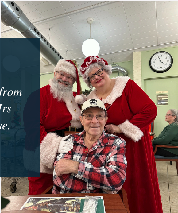
Visit from Mr/Mrs Clause.