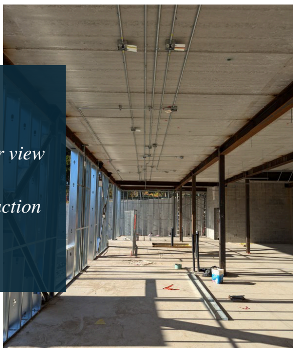
Interior view of the construction

Steel framing has given the structure a relatable feel to the observer, and we expect more external finishing's to provide a discernable shape to the public in the near future.